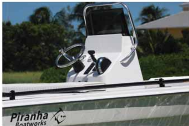
Space for flush mount electronics.