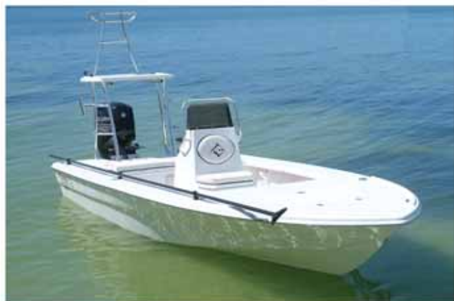
Center Console cooler seat.

We have many great options available for this sleek craft. Available in all our standard colors (White, Canary Yellow, Fighting Lady Yellow, Seafoam Green, Lime Green, Sky Blue, Montana Teal, Kingston Grey, Supreme Black, Vivid Red). Power Poles, Fishfinders, Stereo Systems, Poling Platforms, Trolling motors, Light packages, decking options, Plus much more.